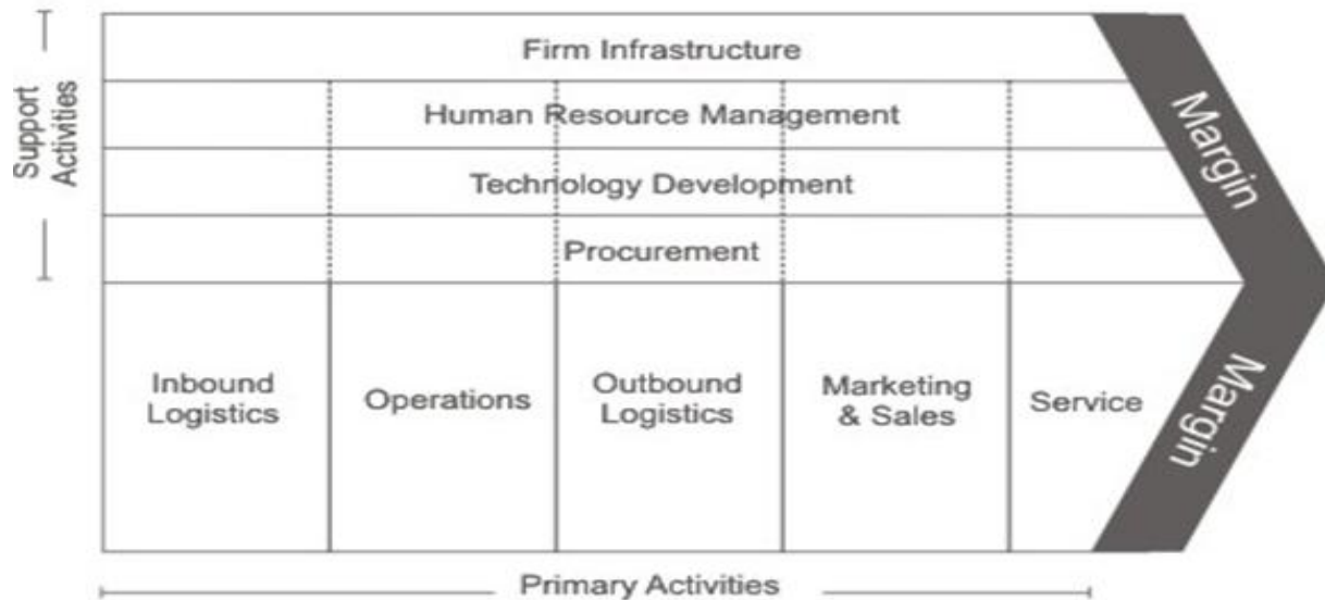
Fig. 1 Michael Porter's Value Chain Model

local level has a great role for influencing the competitive level of the firms. The linkage between the firms also affects the value chain of the products or services. The vertical chain of the firms is most efficient transaction which increases the overall competitiveness of the firms. The support market has their own role for the making of the value chain more efficient in which it includes a legal advices & telecommunication sectors specifics services, handicraft design etc. It is a continuous process which adds value to its chain which started from customer's needs and demands to reach up to the input activities of the primary activities. There are needs of value addition in each stage which help to differentiate it from its competitors at a cheaper rate with best quality. The researchers believe that customers is the ultimate goal of an enterprise which influence them to create such an unique article which fulfill their desired which help by supply chain to provides it in an efficient manners. Willingness of the customers plays a significant role to give direction to the strategic formulating bodies to give preference before manufacturing of their products and services.